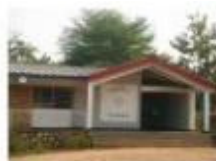
Lycée du Saint-Esprit Gihosha

The College du Saint Esprit (College of the Holy Spirit) was founded by the Jesuits in 1952 on the site of Kiriri. The first cohort graduated in 1958 with 18 Rhetoricians. It was transferred to Gihosha in 1983 and became the Lycée du Saint Esprit retaining its original name. In 2007, there were 846 students of which 54% were girls. Since its creation, there have been more than 3400 graduates. The Association was founded in 1991 and became a legal entity in 2001.