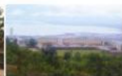
Site of Kiriri Campus (ex-College of the Holy Spirit)